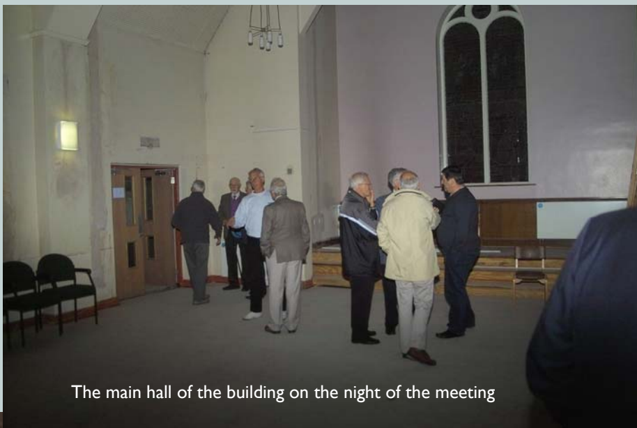
The main hall of the building on the night of the meeting