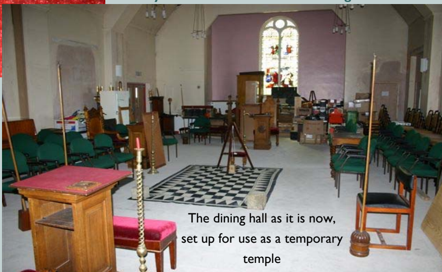
The dining hall as it is now, set up for use as a temporary temple

following Friday was anything to go by. At least twenty masons turned up to help with the move from Church Street to Scotforth. Instead of taking all day it was completed by 11.00 am. Further volunteers have transformed the main hall into a temporary temple as the picture opposite shows. There is still a long way to go. The temple still has scaffold in it but it is obvious that when completed the building will be a modern facility with all that is