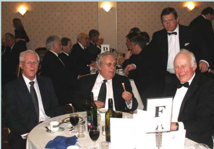
Just some of the 133 Masons attending